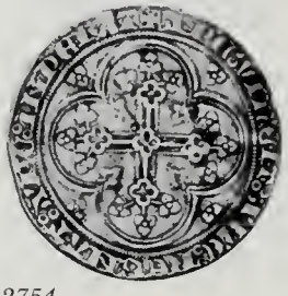
Lot No. 2754